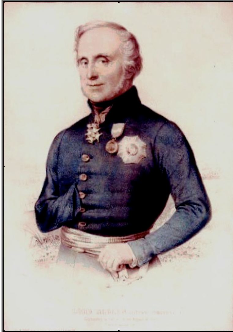
Lord Raglan (Fitzroy Somerset) Commandant en chef de l'Armée Anglaise en Orient. Né le 30 septembre 1786.